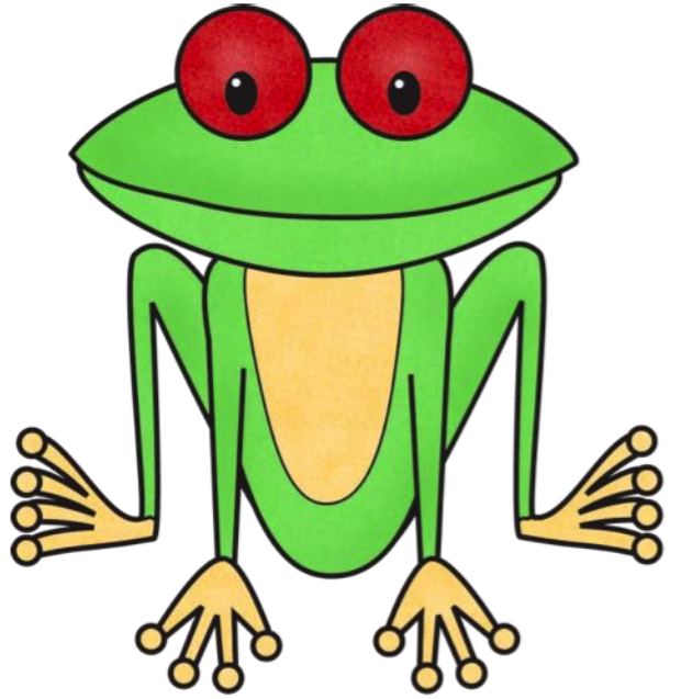
red eyed tree frog