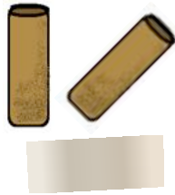
toilet paper rolls