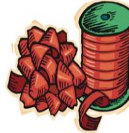
bows & ribbon