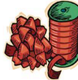
bows & ribbon