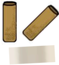
toilet paper rolls